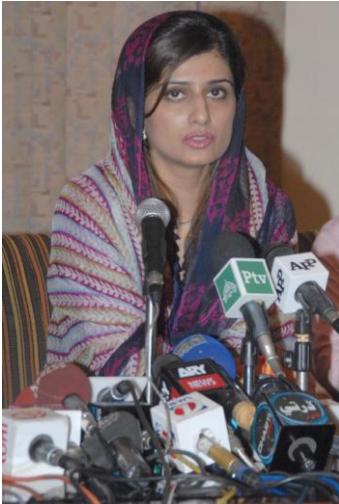
Ms Hina Rabbani Khar is the new Federal Minister of State for Foreign Affairs.

She was sworn in on 19 July 2011 by acting president Farooq Naik. Ms Khar has the distinction of being the youngest and first woman Foreign Minister of Pakistan.