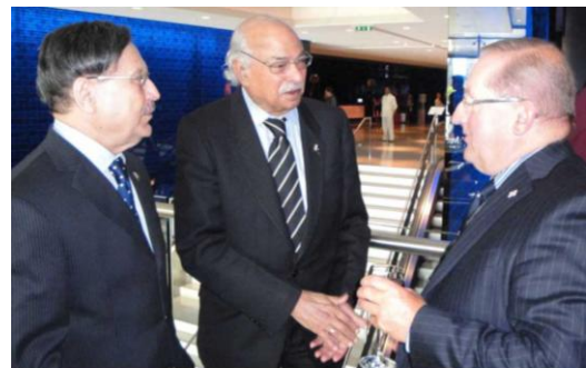
Chairman Senate Mr. Farooq H Naik and Pakistan's High Commissioner Wajid Shamsul Hasan speaking to a delegate at the reception hosted by Chairman Senate in honour of delegates attending 57th Commonwealth Parliamentary Association (CPA) conference, London 25.07.2011