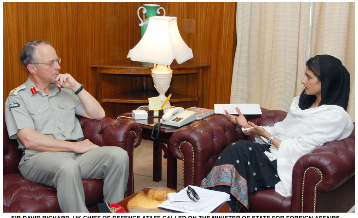
SIR DAVID RICHARD, UK CHIEF OF DEFENCE STAFF CALLED ON THE MINISTER OF STATE FOR FOREIGN AFFAIRS, MS. HINA RABBAI KHAR IN ISLAMABAD ON JULY 6, 2011