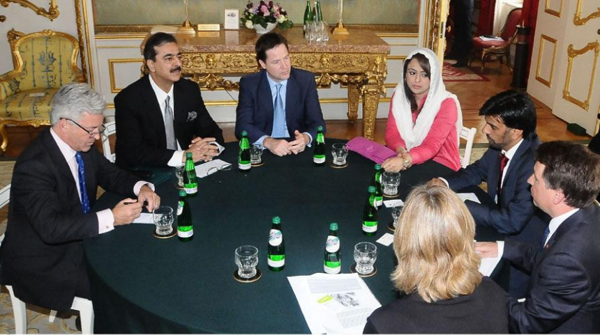
Prime Minister Syed Yusuf Raza Gilani and British Deputy Prime Minister Mr. Nick Clegg in a meeting with chief executives of NGOs, Islamic relief, Save the Children UK and Oxfam at Lancaster House, London on July 19, 2011