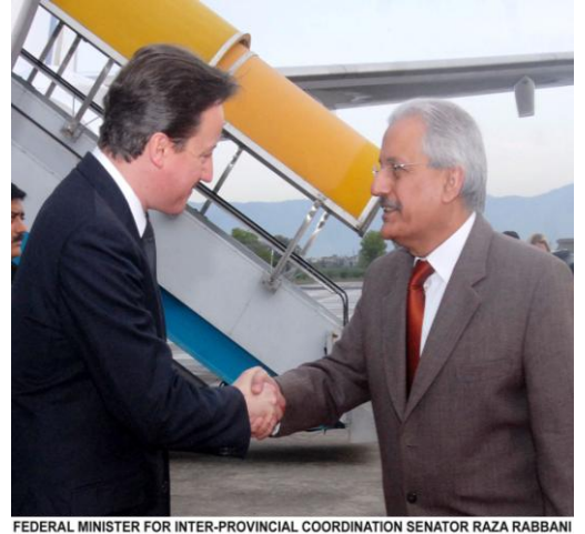
FEDERAL MINISTER FOR INTER-PROVINCIAL COORDINATION SENATOR RAZA RABBANI RECEIVING PRIME MINISTER OF UNITED KINGDOM H. E. DAVID CAMERON AT CHAKLAL AIR BASE, RAWALPINDI ON APRIL 5, 2011