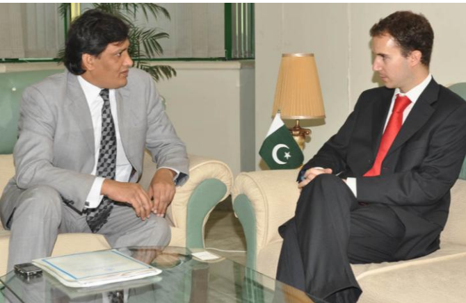
SECOND SECRETARY POLITICAL, BRITISH HIGH COMMISSION, BEN STRIDE MEETING WITH MINISTER OF STATE FOR NATIONAL HARMONY AKRAM MASIH GILL IN ISLAMABAD ON AUGUST 4, 2011