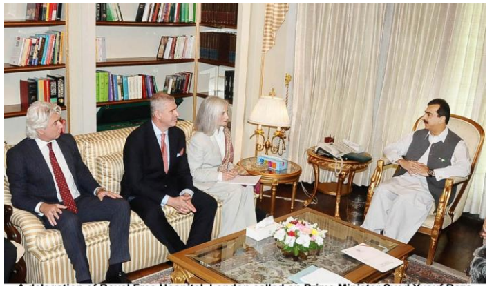
A delegation of Royal Free Hospital, London called on Prime Minister Syed Yusuf Raza Gilani at PM House, Islamabad on August 20, 2011