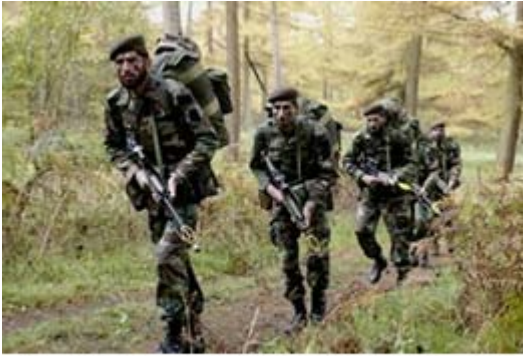
A patrol from the Pakistan Army at the start of Cambrian Patrol