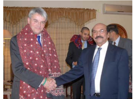
MR. ANDREW MICHAEL, SECRETARY OF STATE FOR INTERNATIONAL DEVELOPMENT, UNITED KINGDOM MEETING WITH MR. QAIM ALI SHAH, CHIEF MINISTER SINDH, AT ISLAMABAD ON NOVEMBER 15, 2010