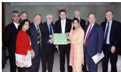
A Group Photo Commonwealth Parliamentary Association (CPA) UK Branch delegation with Speaker National Assembly Dr. Fehmida Mirza at Parliament House on 27.01.2011.

The UK supports the people of Pakistan in a wide range of projects and activities. This declaration will deepen this relationship. The declaration signed in the National Assembly on 27 January 2011, aims to explore several key ways the role of parliament can be strengthened through capacity building and sharing best practice.