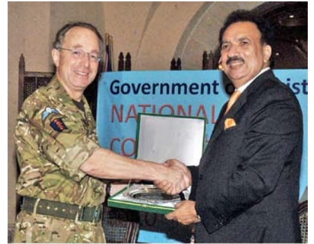
Federal Minister for Interior Senator A. Rehman Malik presenting a souvenir to Chief of Defense UK General David Richard after National Counter-IED Seminar in Islamabad on November 25, 2010