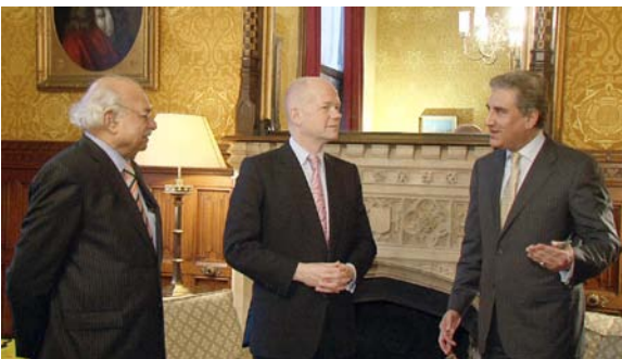
Minister for Foreign Affairs Makhdoom Shah Mehmood Qureshi meeting with British Foreign Secretary William Hague at London on December 1, 2010.