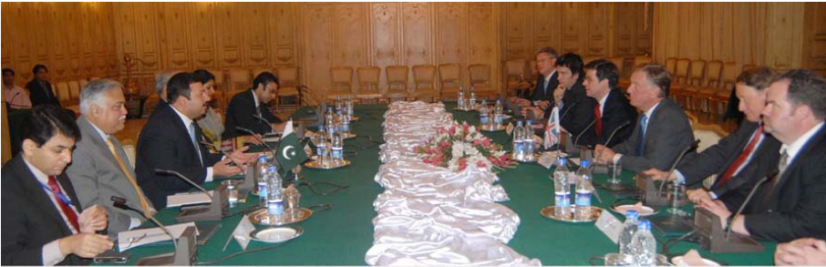
A delegation of British House of Commons Committee on Foreign Affairs led by Mr. Richard Attenborough called on Minister of State for Foreign Affairs Nawabzada Malik Amad Khan in Islamabad on October 28, 2010