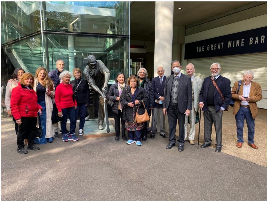
The Pakistan Society UK members touring Lords Cricket Ground in November 2021