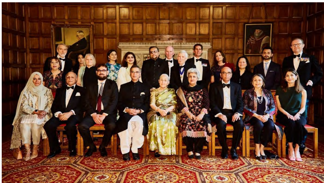
The Pakistan Society UK Committee and guests at the Annual Dinner